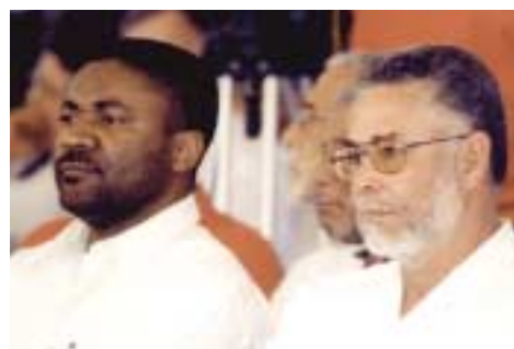
TOP: Audience at the Ground Breaking Ceremony.