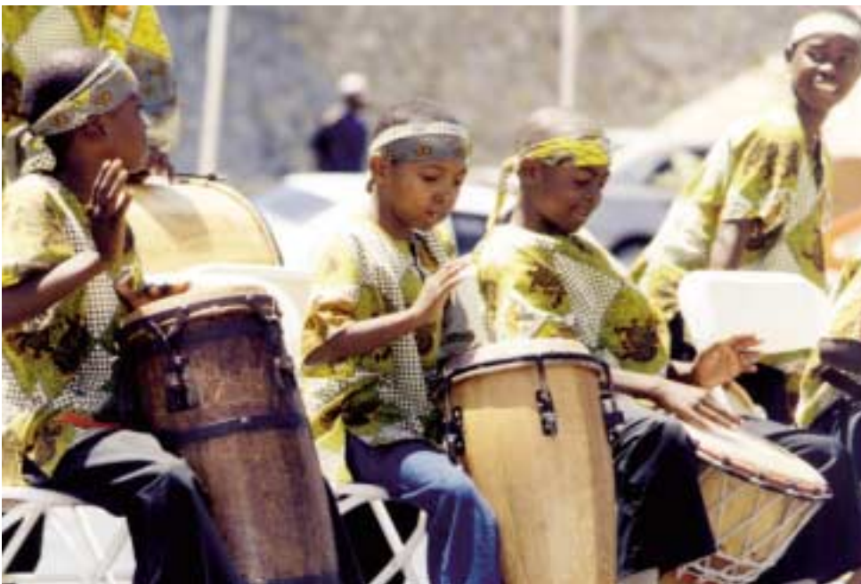
TOP: Lovingdeer backed by the Fab 5 Band MIDDLE: ASHÉ in full flight. BOTTOM: Old Harbour Primary School drummers.