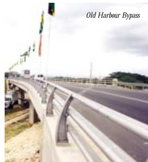
Old Harbour Bypass

This project has endless possibilities. It fills me with hope and confidence that Highway 2000 is certainly a viable pathway to our future.